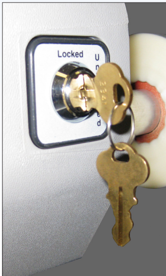
Protection Key Switch