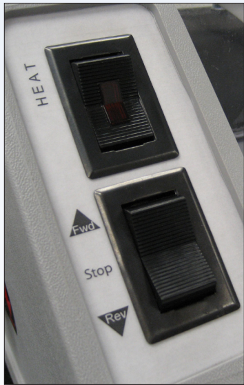
Heat & Speed Switches