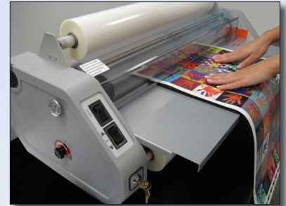
Encapsulation of Prints