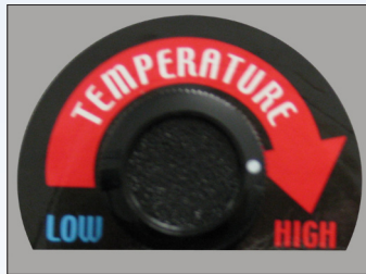
Temperature Control Knob