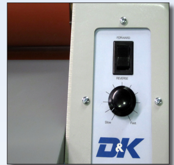
Speed Control &amp; FWD/REV