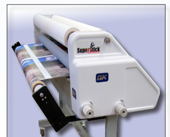
Rear Media Rewind