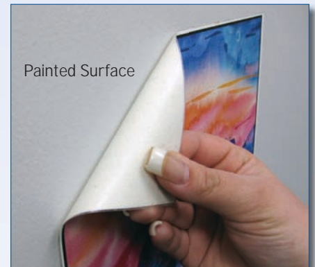
Residue-Free Graphic Removal