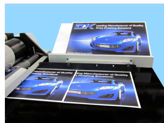
Hand Feeding Sheet Tray