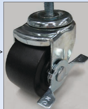
Heavy Duty >> Locking Casters