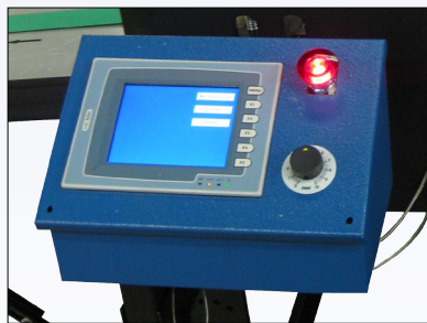
Digital Touch Screen Controls