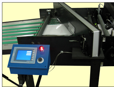
Diagonal Cutting System