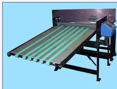
Oversized Exit Table for Large Prints